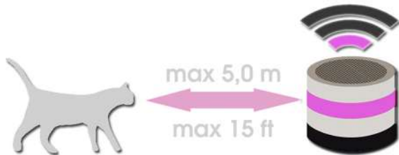
Indoor maximum range

Position RelaxoPet® PRO indoor within a radius of max. 5 m / outdoor max. 3 m (see sketch below), in the main residence area of the cat and be careful that RelaxoPet® PRO is out of reach for your cat.