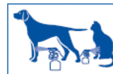
5 Narrow jet for paws and skin folds, standing