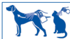
2 Spray against direction of hair growth, holding the animal