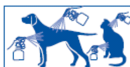
3 Large jet for back and sides, standing